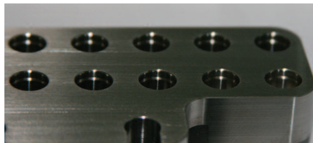
Inverted upper tool shows the body passage.

Another common issue related to mismatched tooling and capsules stems from normal tooling wear. Many ingredients that go into capsules are abrasive and, over time, wear the tooling to a point where the tool no longer supports the capsules, which causes joining defects. The problem is often misdiagnosed as a capsule quality issue, and I've fielded a few of those calls. Other times, instead of discussing the issue with Capsule Supplier A—whose products have worked well for years—the manufacturer suspects the supplier's quality has declined and begins to favor Capsule Supplier B. In reality, it is more likely that the condition of the tooling has changed, and the filler now runs better with a capsule