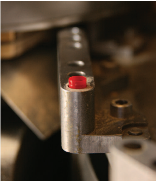
A damaged lower tool will often cause the capsule body to sit high.

The lower tool. The lower, or body, tool usually suffers damage from operator handling. See the image at the top of the next page. Damage from handling often occurs at the top surface of the tool, which is generally flat, with no