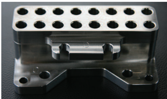
The cap and body segments as they appear when assembled.

Consider a manufacturer that has just purchased several high-speed capsule fillers to handle demand for its new product. As the machines fill the capsules, it becomes apparent that a large percentage of empty capsules are not separating and instead go straight to waste, thereby causing excessive losses of both capsules and powder. Eventually, someone finds that the bore of the upper capsule tool is slightly undersized, causing the cap to pinch the body and preventing it from releasing and separating properly. What to do? Given the investment, changing capsule fillers isn't an option, and the manufacturer also has a long-standing commitment to buy from its capsule supplier. The only options are to purchase custom tooling or to somehow alter the capsule design, a