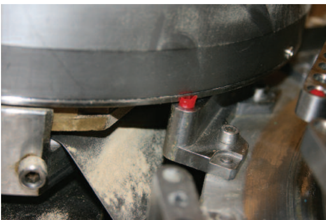
Because the capsule body cannot descend into the tool, its edge is crushed over during filling. This critical defect is called a body fold.