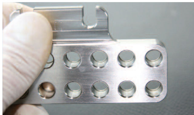
The cap seat, near the bottom of the upper tool, is where the edge of the capsule rests once inserted.

As the number of suppliers of capsules, equipment, and tooling increases, the risk of problems also grows. Many manufacturers have on their shelves tooling that will not work with capsules from certain suppliers. There are also many boxes of capsules gathering dust in warehouses because the dimensions of the capsules are incompatible with the manufacturer's filling equipment. The ensuing challenge then is to educate everyone who fills capsules to understand the interaction between the tooling and the capsules. Only then will they be able to decide whether to change or add capsule suppliers, purchase new capsule fillers, and/or specify non-OEM tools. A good understanding of the issues will also help manu-